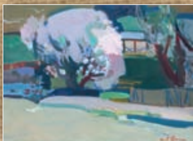
Ara Bekarian "Blossomed Apricot Tree"